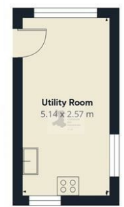
Floor 0 Building 3